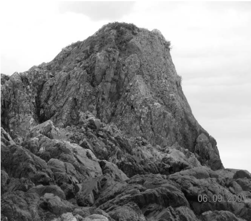
Figure 2. Example of lack of plant succession on rocks used by Black Oystercatchers nesting in Sitka Sound, Alaska. Images were taken in 1940 and 2007 (dated) at different angles.